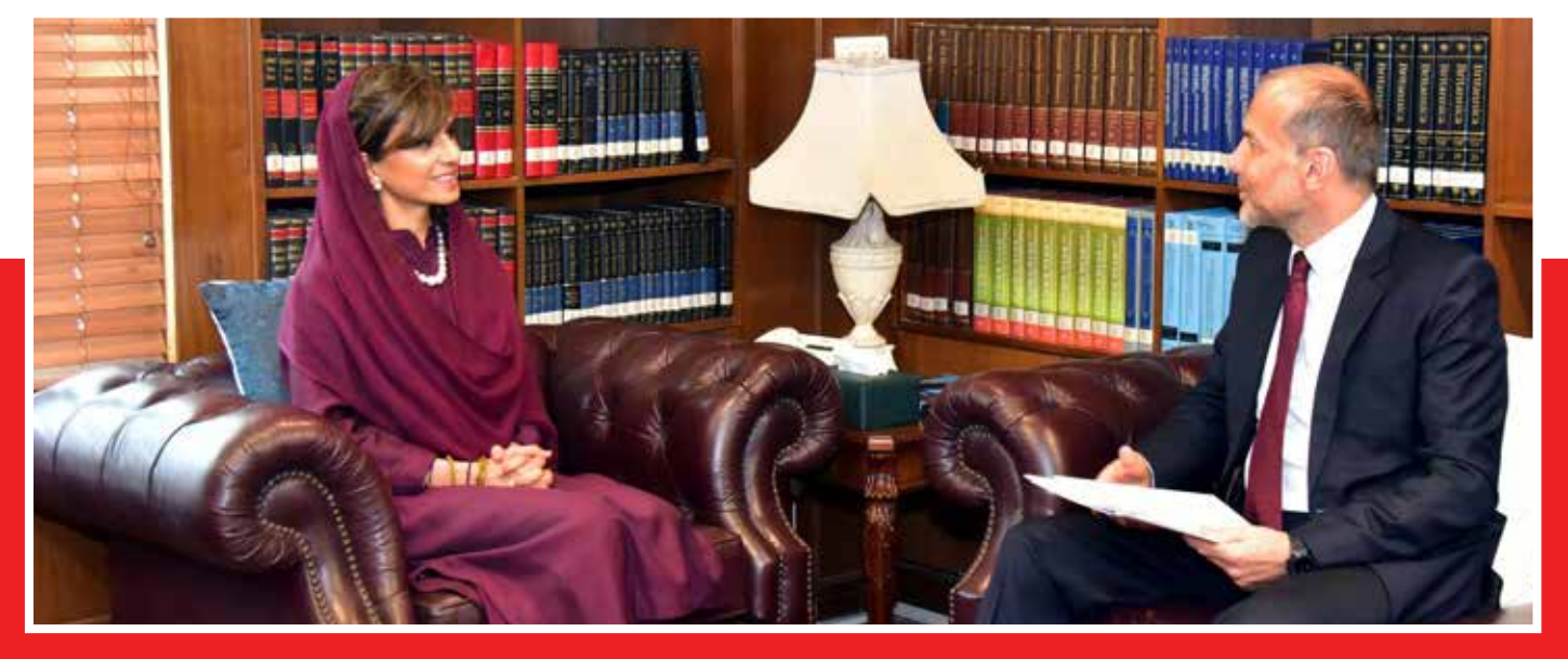
Minister of State Hina Rabbani Khar received Ambassador of Switzerland discussed Bilateral ties & cooperation between Pakistan and Swistzerland.