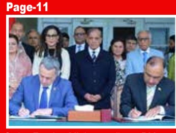
Swiss Foreign Minister calls on PM Pakistan – Signs MoU