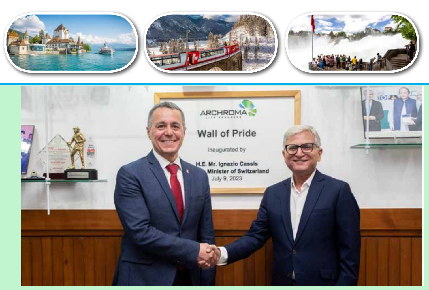
Foreign Minister of Switzerland H.E. Mr. Ignazio Cassis felicitating Mr. Mujtaba Rahim at the inauguration of "Archroma Wall of Pride"

of quality in the labs can be compared with any other global institution.", commented Foreign Minister of Switzerland Ignazio Cassis.